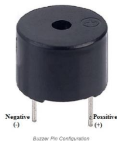
Figure 4.1: Buzzer

It is often powered by DC voltage and used in timers, alarm clocks, printers, computers, and other electronic devices. It can produce a variety of sounds, including alarm, music, bell, and siren, according on the varied designs.