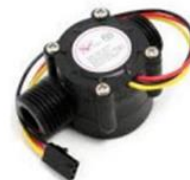
Figure 2.1: Water Flow Sensor YF S201

The Water Flow Sensor YF-S201 1/2 inch includes a pinwheel sensor that measures how much water has passed through it, and it is positioned in line with the water line. A built-in magnetic Hall-Effect sensor generates an electrical pulse with each rotation. YFS201 hall effect water flow sensor has only three wires and it can be easily interfaced between any microcontroller and Arduino board. It requires only +5V Vcc and gives pulse output, the sensor needs to be tightly fitted between water pipeline.