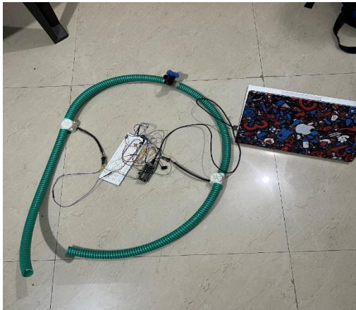
Figure 6.1: Hardware Circuit