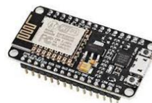
Figure 1.1: Node MCU GPIO

The ESP8266 is a chip, but it's also challenging to access and use. Simple activities like turning it on or sending a keystroke to the chip's "computer" require soldering wires with the right analogue voltage to its pins. It must also be programmed using low-level machine instructions that the chip hardware can understand. The ESP8266 may be used as an embedded controller chip in mass-produced electronics with this level of integration without any issues. It is a huge burden for hobbyists, hackers, or students who want to experiment with it in their own IoT projects.