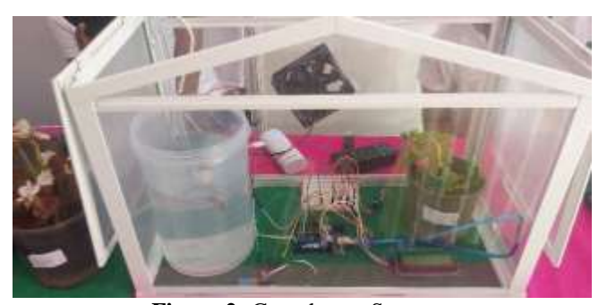
Figure 2: Greenhouse System

This design is to promote convenience and ease of factory growth for small scale growers and also enable small scale growers to plant healthy crops all time round with little supervision. It helps to save time and trouble of growers and with effective cost.